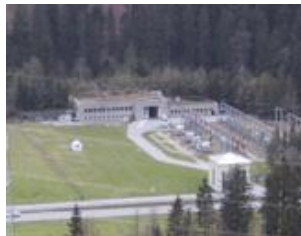
Braz Power Plant