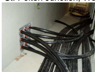
Collector Wagram Junction