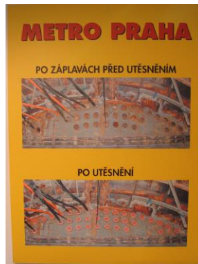
Metro Prague before/after sealing

Complete Tunnel sealing of all lines stations and lanes after Century Flood 2002