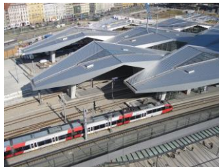
Vienna Main Station

Nearly all central control towers: Vienna Southern, Vienna Matzleinsdorf, Vienna-Stadlau, Vienna-Meidling, Graz, St. Pölten,