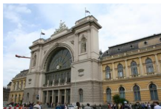
MAV Budapest Keleti Station

Misc. signalling and control cabinets along Budapest - Hegyeshalom