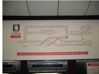
Singapore MRT Network

Stations: Buangkok, Clark Quay, Sengkang, Chinatown, Dhoby, Outram MRT Depot