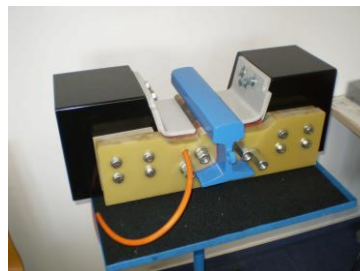
Rail Sealing Metro Prague