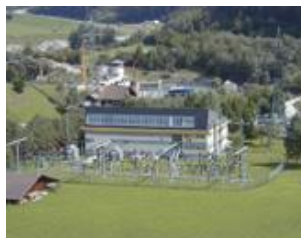
Fulpmes Power Plant