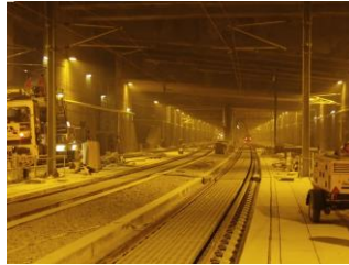
Wienerwald Tunnel Junction