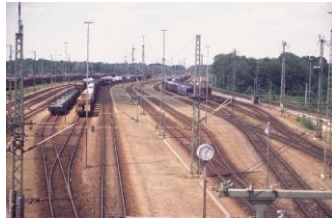
Munich North Marschall Yard

Munich Marshalling Yard Baden-Baden Switch Control Cabinet Bad Kreuznach Passenger Station Fulda-Neuhof Station Limburg Station Weingarten Station Telecom plant Leipzig Communication Center