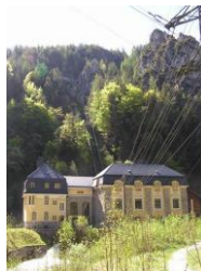
Powerplant Mariazellerbahn Wienerbruck