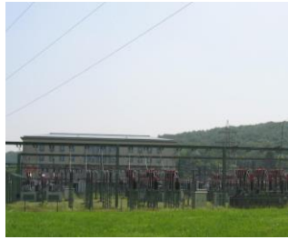
Inverter Plant Vienna-Auhof