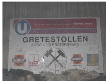
Vienna Metro Tunnel U2/4

Wiener Linien (Vienna Transport): Misc tunnel pipe and cable sealings Vienna Underground Railway Lines 1,2 4