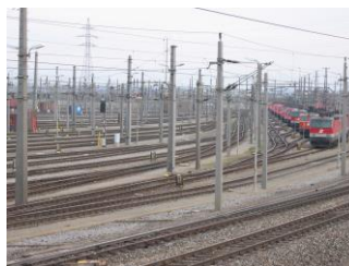
Marshalling Yard Kledering