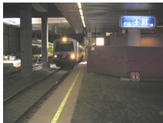
Vienna Airport Station