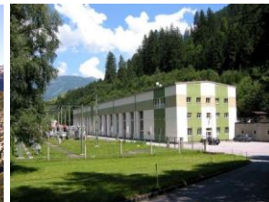
Tauernmoos power plant with Uttendorf center